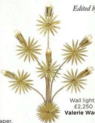
Wall light, £2,250 Valerie Wade