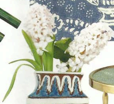
Vase, £750 Molly Hatch for the V&A