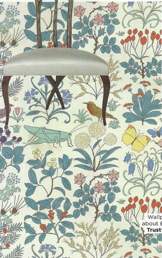
Wallpaper, about £116/roll Trustworth