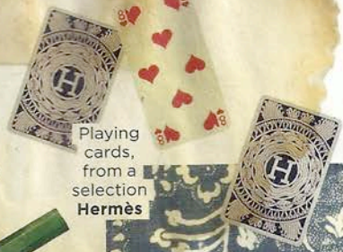
Playing cards, from a selection Hermès