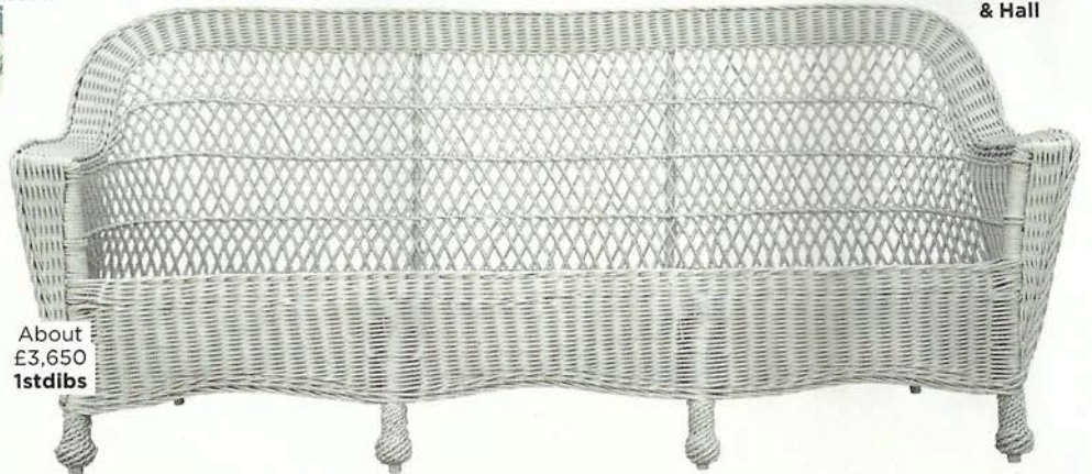
About £3,650 1stdibs