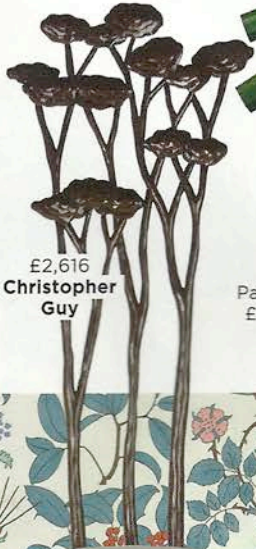
£2,616 Christopher Guy