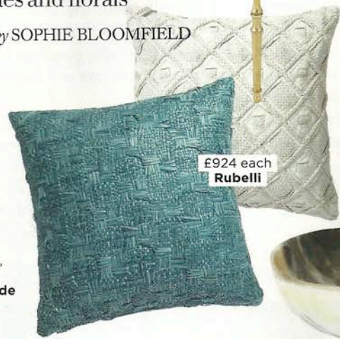
£924 each Rubelli