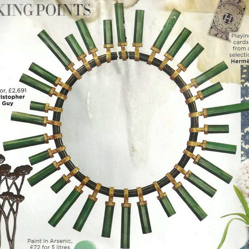
Mirror, £2,691 Christopher Guy