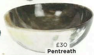
£30 Pentreath & Hall